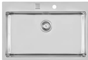
Sink KE Filotop 2266 050