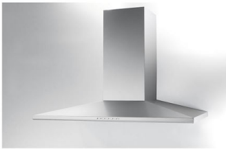
Hood Amélie 2447 090